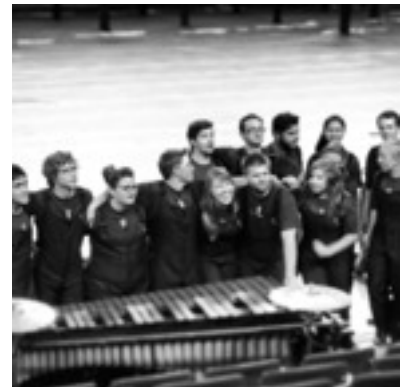
Kappa Kappa Psi-Beta Omicron

The music is what gave me fright. The music is what made me sad. The music is what made me stay a film major.